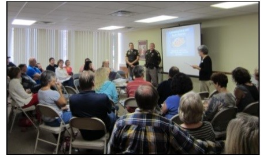
The Family & Youth Services Bureau has hosted workshops for many years on topics of interest to community members, parents, educators and social service professionals. In 2017, the topics will focus exclusively on substance abuse issues in our community.

There is no fee to attend these workshops, but space is limited so RSVP early if you want to attend. Refreshments of cookies, coffee, and lemonade are provided at each workshop.